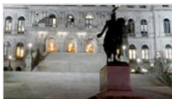
Blog: The Spin Cycle