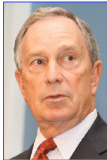
MAYOR BLOOMBERG: Keeping pressure on unions.